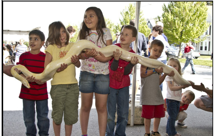
Fun at the library. Children holding a boa constrictor at the Feldman Children’s Celebration.