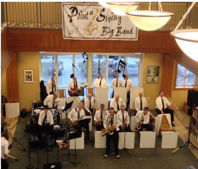
Point n' Swing Big Band performance funded through the Millette Memorial Trust Fund